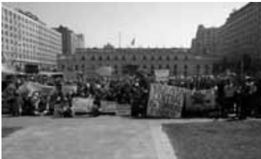
Demonstrators gather in front of Moneda Palace, Chile’s seat of government, to protest against the proposed dams in Patagonia

www.patagoniasinrepresas.cl (Spanish and other languages)