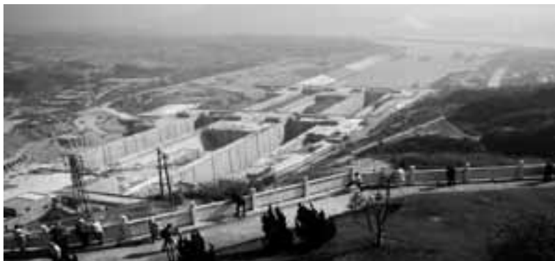
The Three Gorges Dam in China

Vast projects such as the Ilisu Dam in Turkey are only made possible through German export subsidies like the ones granted by the KfW bank, government export credit guarantees or contracts of suretyship with other nations. This is why protests against these large dam-building schemes must be mobilised even further at international level. In India, work is being carried out on the Narmada Dam system, which is one of the world's largest water-related construction projects. The centrepiece is the Sardor-Sarovar Dam, against which the inhabitants of more than 245 villages, due to be inundated, are putting up fierce resistance.