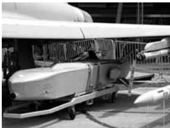
A Taurus KEPD 350 cruise missile under the wing of a Eurofighter Typhoon jet plane, but not mounted to it

to its destination. Every single one of the 600 Taurus cruise missiles which were manufactured for Germany contains about a quarter of a ton of uranium.