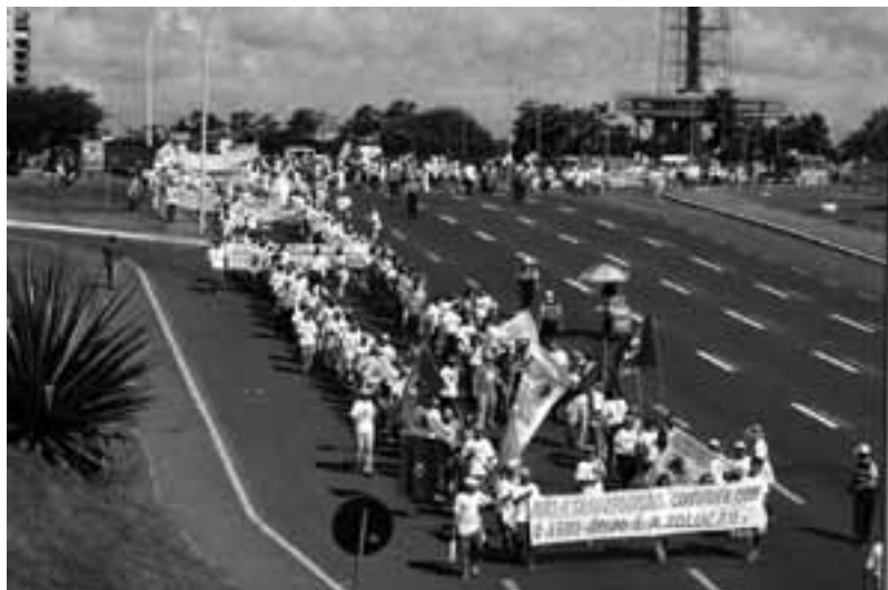
Protestors in Brasilia in March 2007