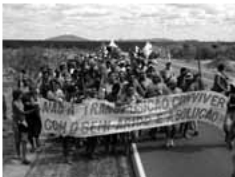
Protestors occupying the construction site in Cabrobó, Pernambuco in June 2007